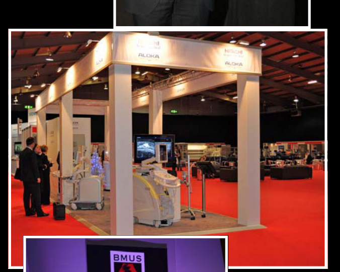
The Hitachi Aloka stand stood proud and reported a record number of visitors