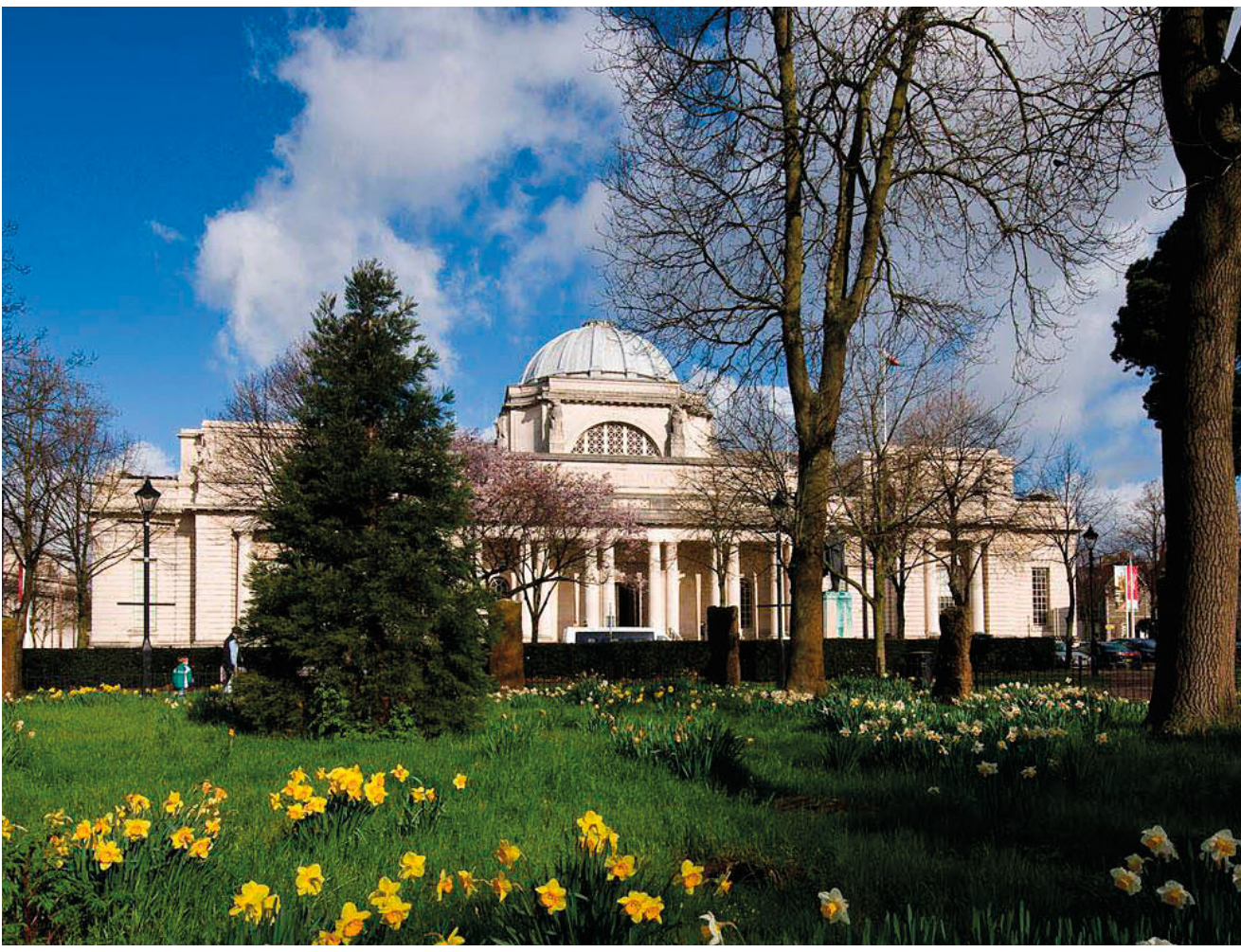
National Museum, Cardiff