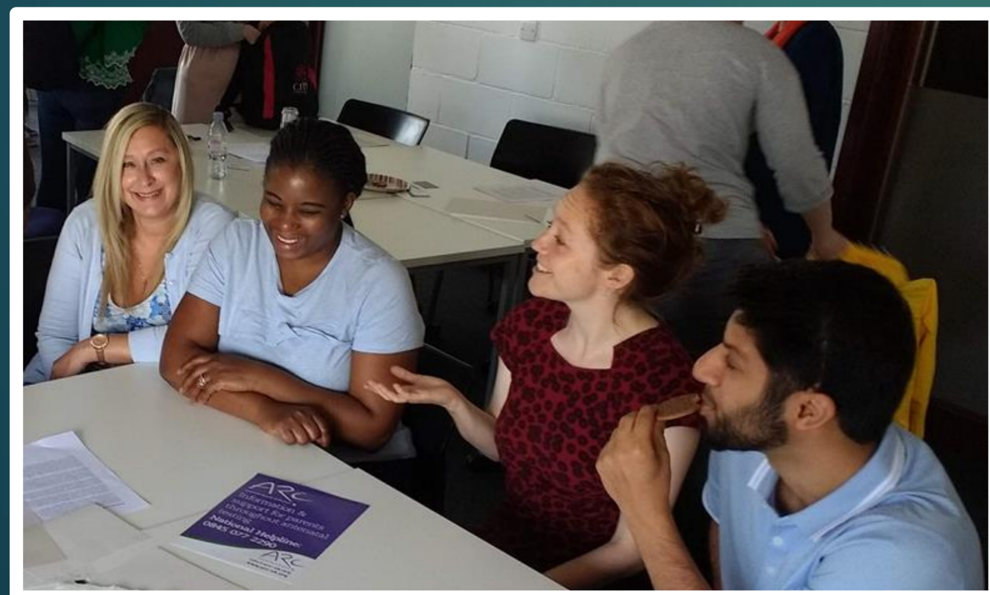
Image 1: Students discussing a representative from ARC (Antenatal Results and Choices)