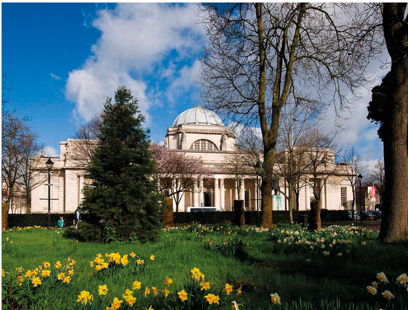
National Museum, Cardiff