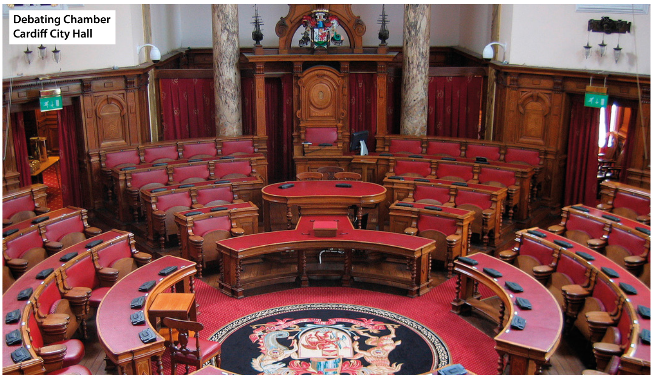
Debating Chamber Cardiff City Hall

When you plan your time, please also consider supporting the Young Investigators' session at 3.30pm on Day 2. This is an opportunity for younger colleagues to win the honour of representing BMUS at Euroson 2016 in Leipzig; the standard is high and the entrants deserve our encouragement.